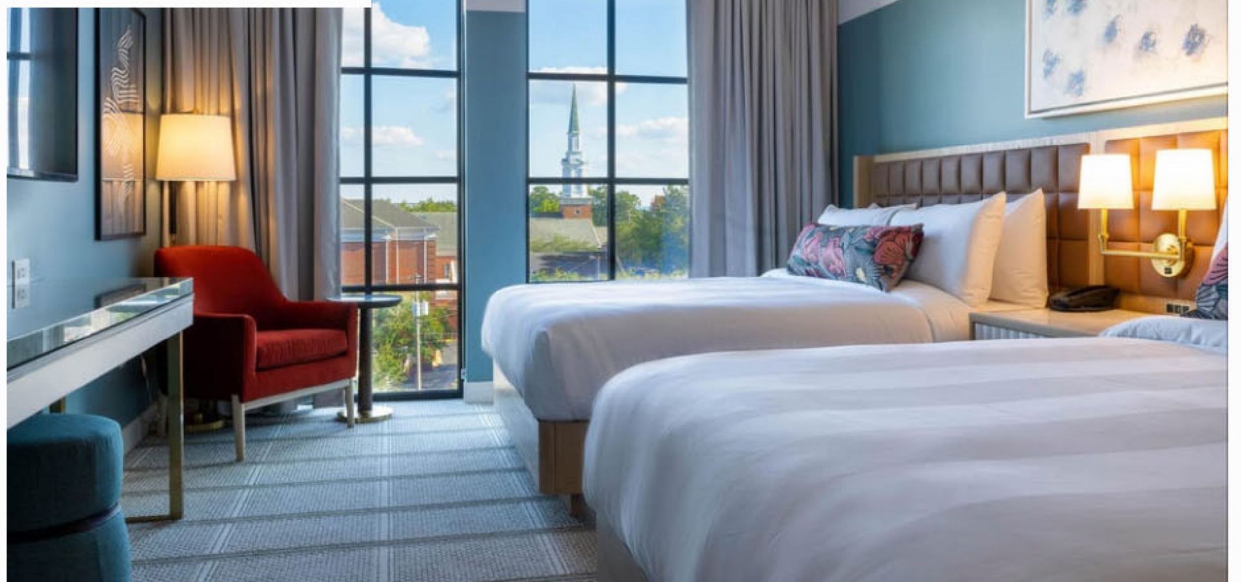
A guest room at The Alamite THE ALAMITE

And as of last month, Saban can add a new title to his list: investor and co-owner of The Alamite .