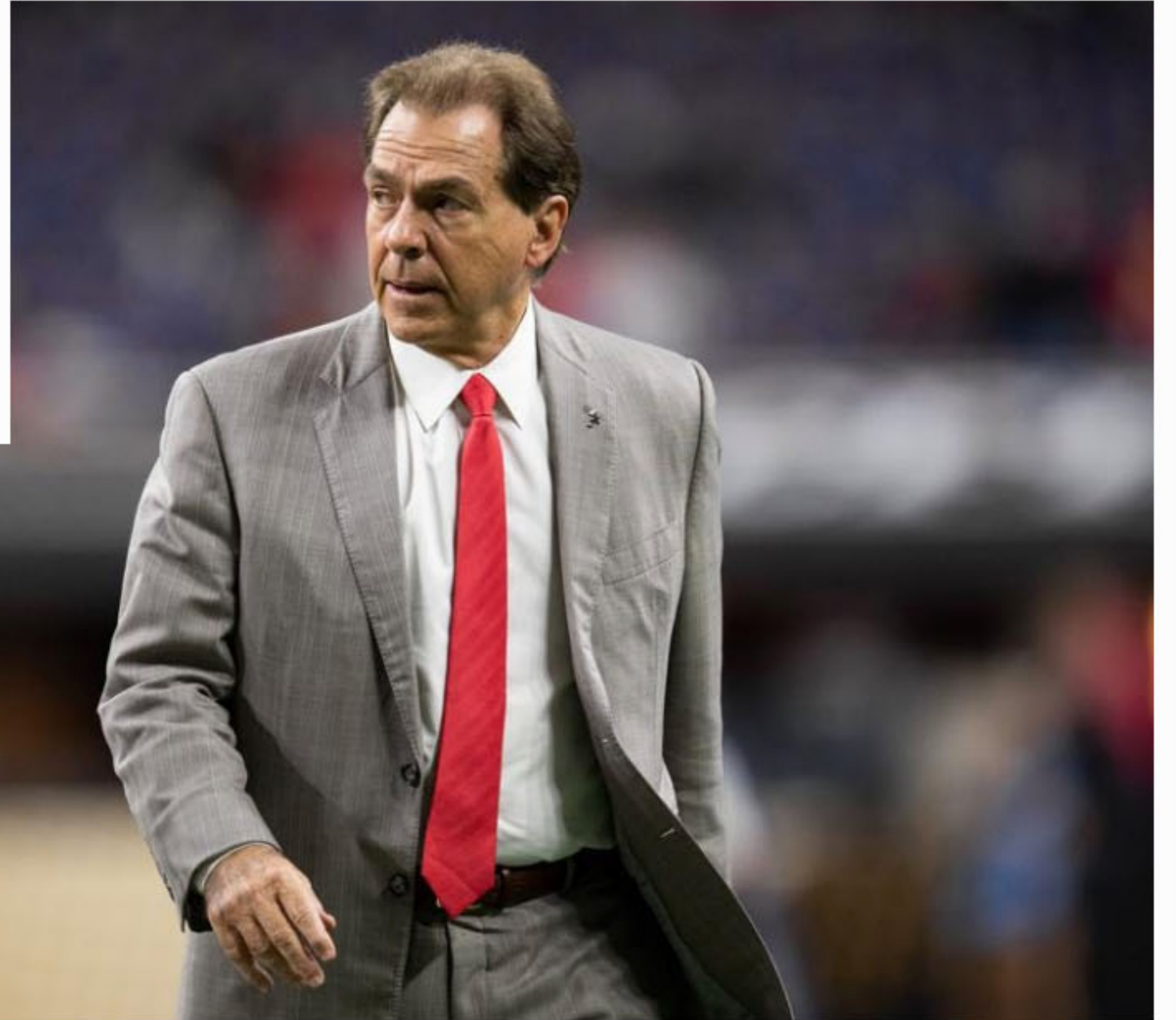
Alabama Crimson Tide head coach Nick Saban

Nick Saban is a man of many accomplishments. He's been the head coach of the Alabama Crimson Tide since 2007. During his tenures at LSU and Alabama, he led his teams to seven impressive national championships. In addition to being widely considered the greatest coach in collegiate football history, he's also the highest paid one earning a $9.8 million base salary this year.