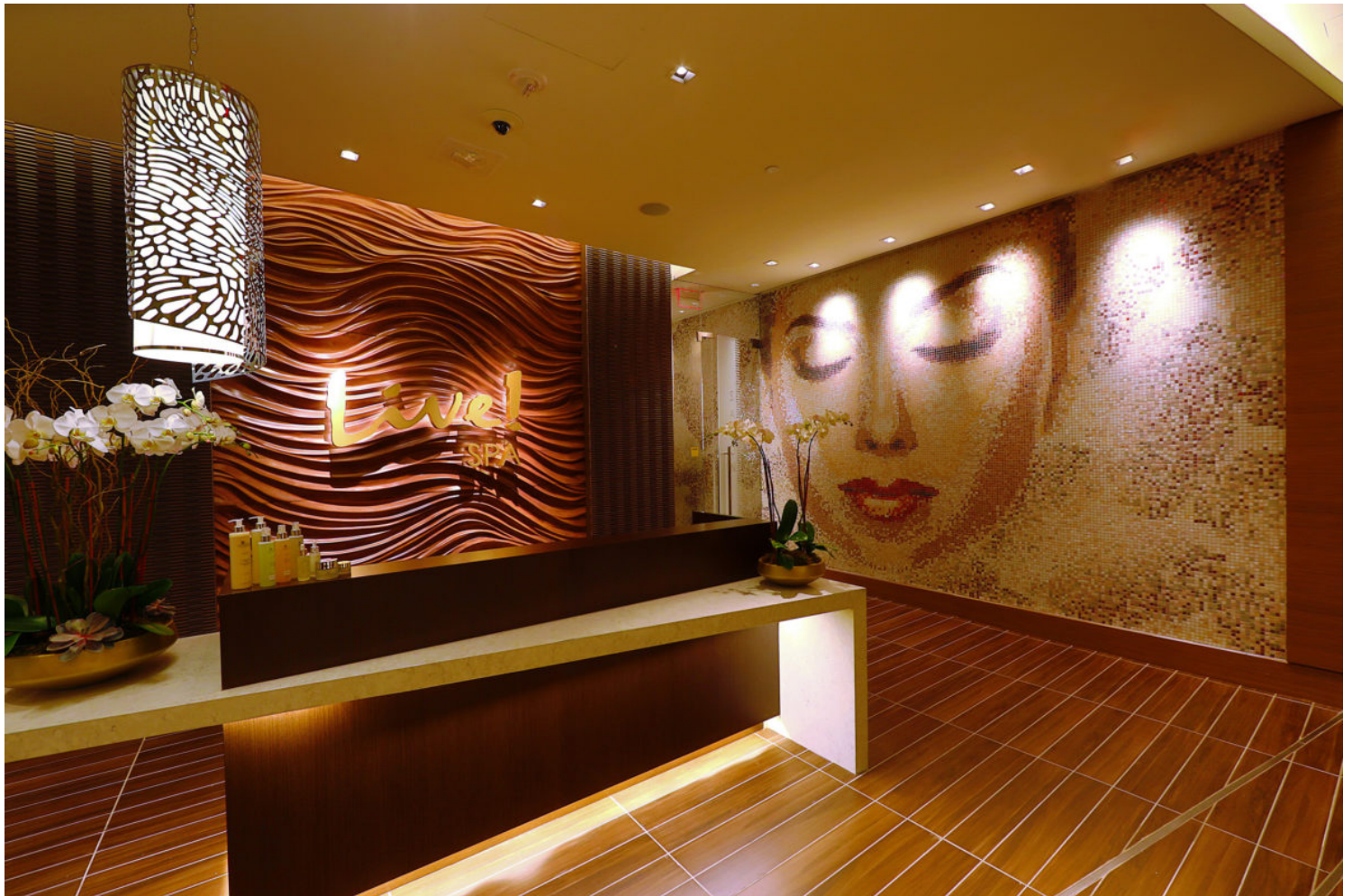
Live! Hotel's Spa.

When you need to rest your head, do it in style in one of the resort's Aspire Royal Suites. At 3,500 square feet, these palatial spaces offer two master bedrooms (each with its own Jacuzzi) and perks such as limo transfers from the either Bradley or Providence ( https://www.forbestravelguide.com/destinations/coastal-rhode-island-rhode-island/travel-guide ) airport and 24-hour butler service.