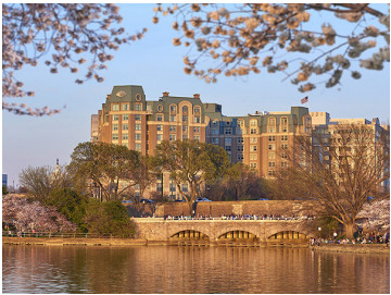
5 D.C. Hotels That Both Sides Can Agree On ( https://stories.forbestravelguide.com/5-d-c-hotels-that-both-sides-can-agree-on )