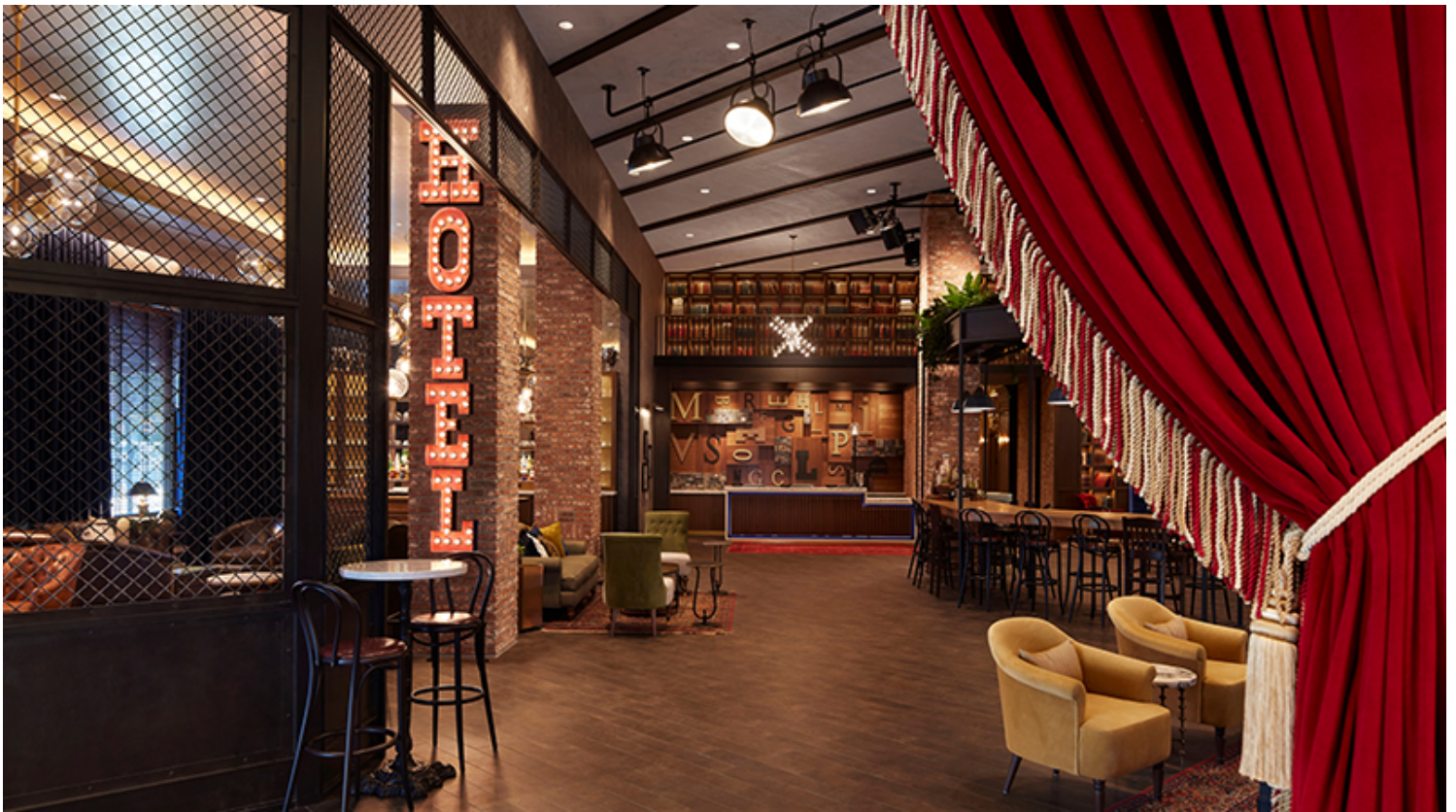
MGM Springfield.

It's easier than ever for East Coasters to enjoy the amenities of Las Vegas ( https://www.forbestravelguide.com/destinations/las-vegas-nevada/travel-guide ) without hopping on a plane or giving up any of the high-rolling fun that the iconic city has to offer.