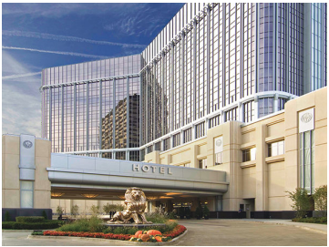
5 Hot Staycations To Beat Winter's Chill ( https://stories.forbestravelguide.com/5-hot-staycations-to-beat-winters-chill )