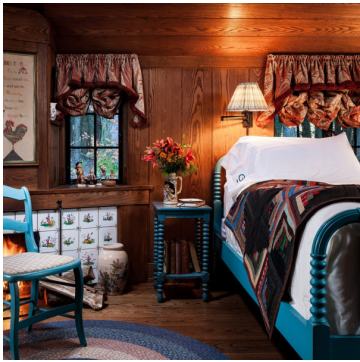
6 Rural Retreats To Help You Recharge ( https://stories.forbestravelguide.com/6-rural-retreats-to-help-you-recharge )