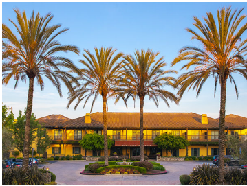
Where To Travel In March ( https://stories.forbestravelguide.com/where-to-travel-in-march-4 )