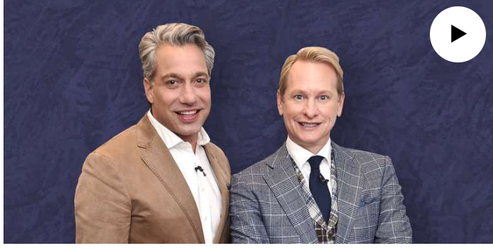
This Holiday Decorating Trend Needs To Be Stopped