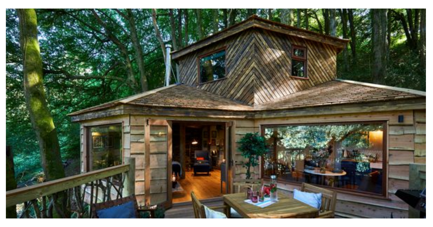
This Luxe Treehouse Rental Is Chicer Than A Hotel